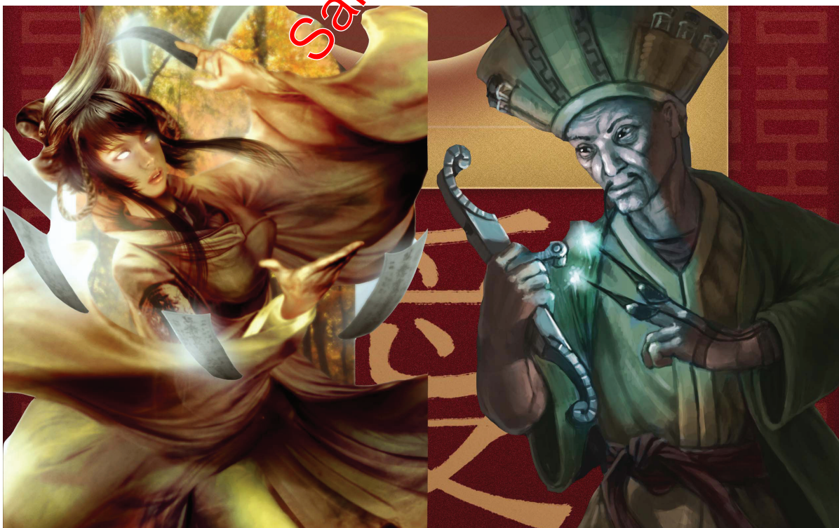
Welcome to the Lands of the Jade Oath