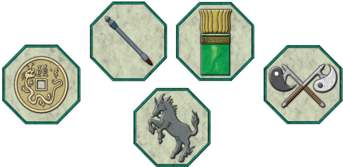
Ministerial insignia for the Golden Coin, Iron Pen, Jade Pillar, Silver Axe and Steel Ki-Rin governmental ministries.

the country with few roads and rivers crisscrossing the land to connect them.