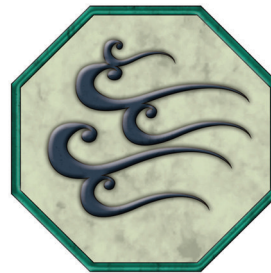
Ministerial Insignia for the Ivory Fan, Ebon Mirror, Dark Lantern and Black Wind governmental ministries.

worshiping of ancestors and various gods by the Emperor - in his capacity as the "Son of Heaven" - and looking after the welfare of visiting ambassadors from tributary nations. The concept of courtesy is considered an integral part of education. An intellectual is said to "know of books and courtesy (i.e. rites)". Thus, the ministry's other function oversees the nationwide civil examination system for entrance to the bureaucracy. Many see state-sponsored exams as the way to legitimize a regime by allowing the intelligentsia participation in an otherwise autocratic and unelected system. The other concern of this ministry is the regulation and monitoring of the wu-lin societies and supernatural creatures throughout the empire. Consequently, they oversee the Bureau of the Ebon Mirror.