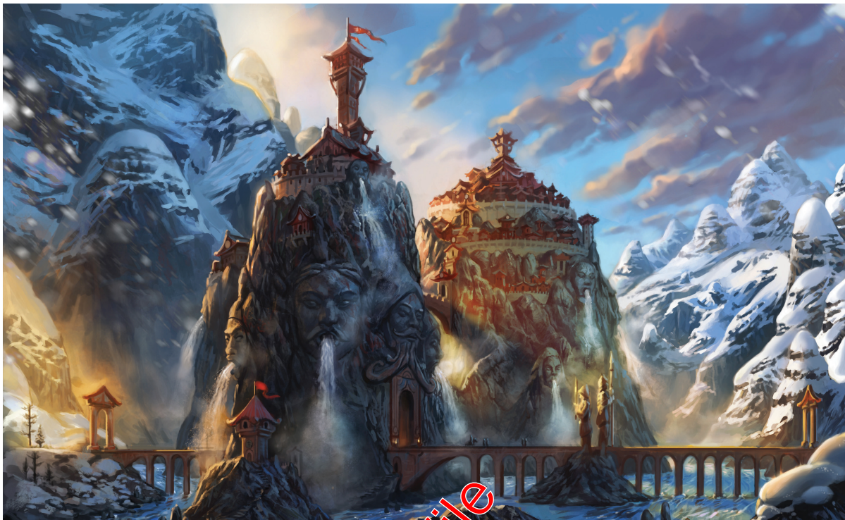
Xinmar, trade city of the Heaven's Reach Mountains

Rumor has it that the Thunderous Cricket allows no crime in the city unless it has a stake in the profits. Voicing such rumors can be dangerous within the city limits.