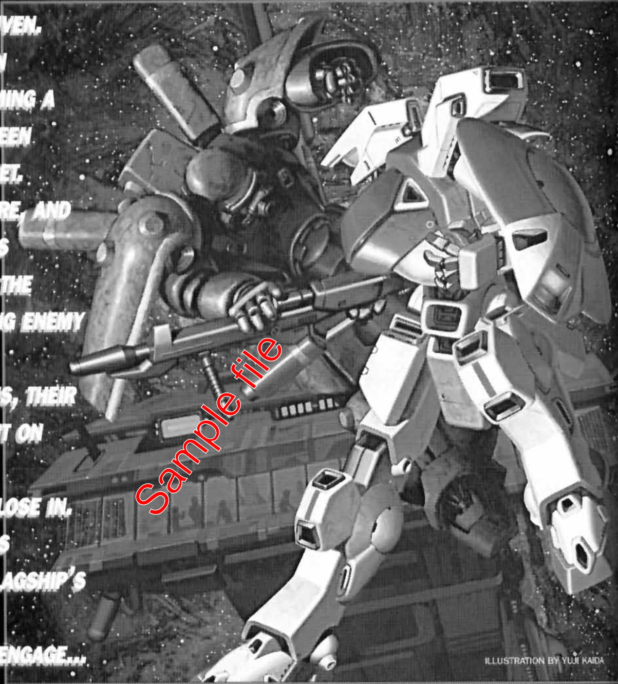
ILLUSTRATION BY YUJI KAIDA